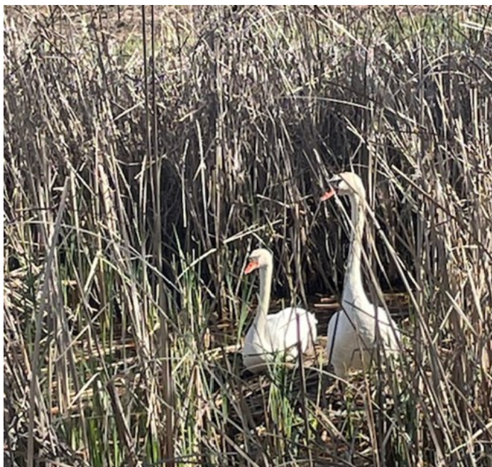
Figure 3. Mute swan on nest (on left) in tules at Tule Pond, Camanche Reservoir South Shore Recreation Area. 23 March 2025.

I only observed four active nests (Figure 3) and four swan broods (with 4, 6, 7 and 8 young) at four waterbodies in 2025, but these small numbers likely resulted from the few (9) surveys after 7 May and none after 2 June. All four waterbodies with nests or broods had extensive areas of emergent vegetation and two had islands. A pair I monitored at Dogtown Road pond during four years since 2019, when swans arrived, twice produced zero young and five young. Thus, productivity overall in the region averaged 4.4 young/nesting pair for the eight monitored nesting attempts.